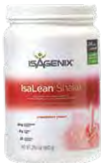
Strawberry Cream canister & packet