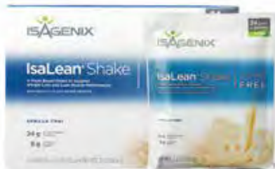
Vanilla Chai: 24 g Protein packet only