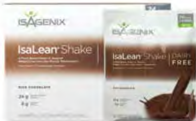
Rich Chocolate: 24 g Protein packet only