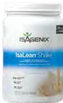
Creamy French Vanilla canister & packet