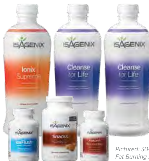
Pictured: 30-Day Cleansing and Fat Burning System

*After a 10-week study, subjects on the Isagenix System had superior results compared to a heart-healthy group. The UIC study was a major milestone for Isagenix, and its findings were reported in two reputable peer-reviewed journals in 2012 – Nutrition Journal and Nutrition & Metabolism. See IsagenixHealth.net/Isagenix-Science for additional information.