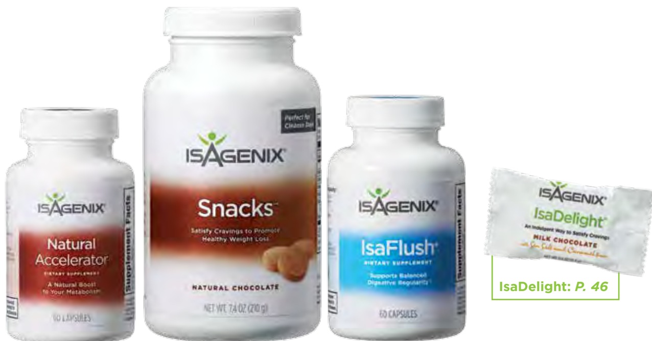
IsaDelight: P. 46