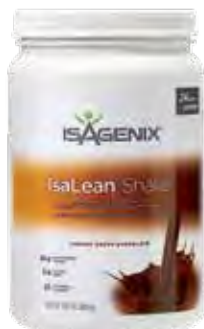
Creamy Dutch Chocolate canister & packet