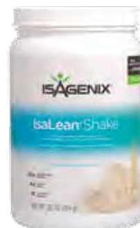
Natural Creamy Vanilla (kosher) canister only